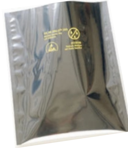
Moisture Barrier Bag with Humidity Indicator Card and Desiccant